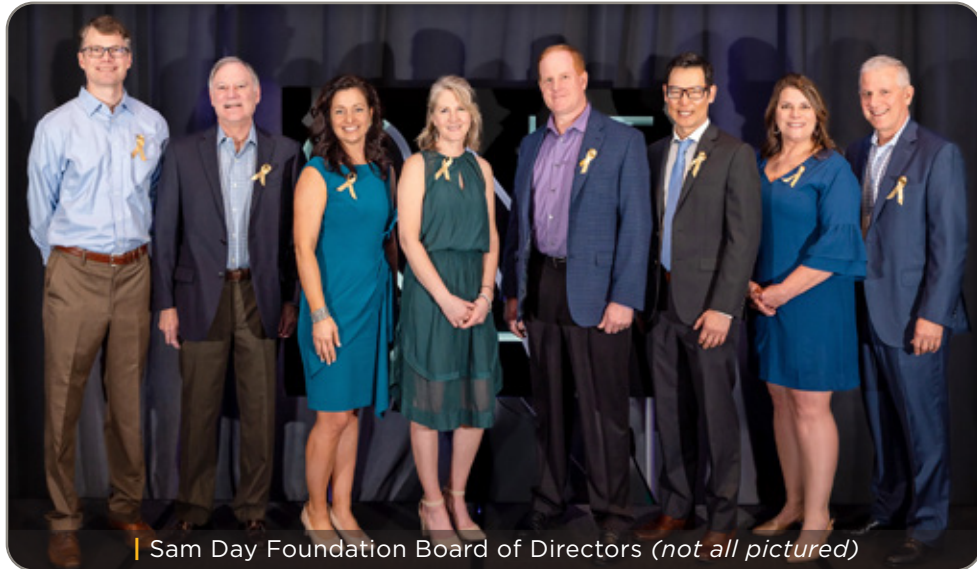
| Sam Day Foundation Board of Directors (not all pictured)

Our mission remains focused on advancing research for childhood sarcomas and brain tumors because our top priority is to ensure more kids with cancer can live longer and healthier lives. We've also realized that the community and resource support has organically become a core strength of SDF. Our new plan takes into account our values, resources, and the needs of families to seek to navigate a fruitful path forward.