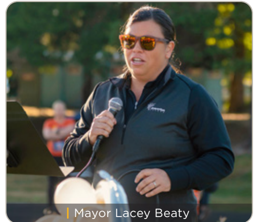
| Mayor Lacey Beaty

Beaverton Mayor Lacey Beaty participated in the Sam Day 5K and subsequently invited SDF to bring the run into the City of Beaverton in 2023 as a positive community event.