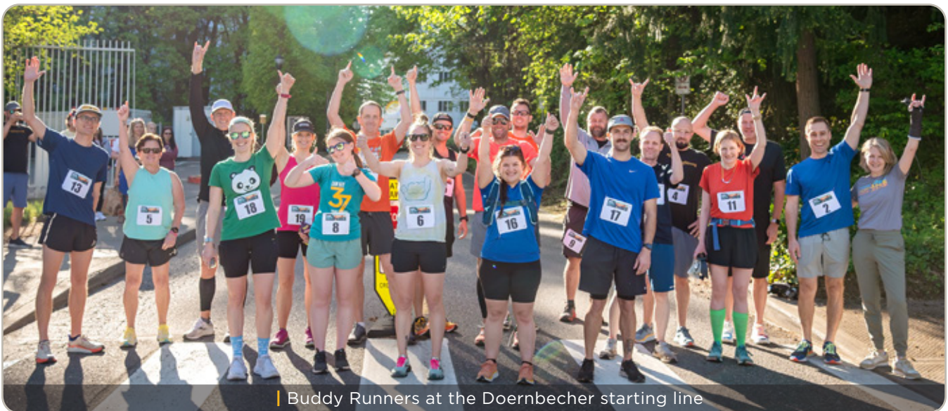
| Buddy Runners at the Doernbecher starting line