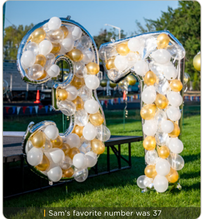
| Sam's favorite number was 37